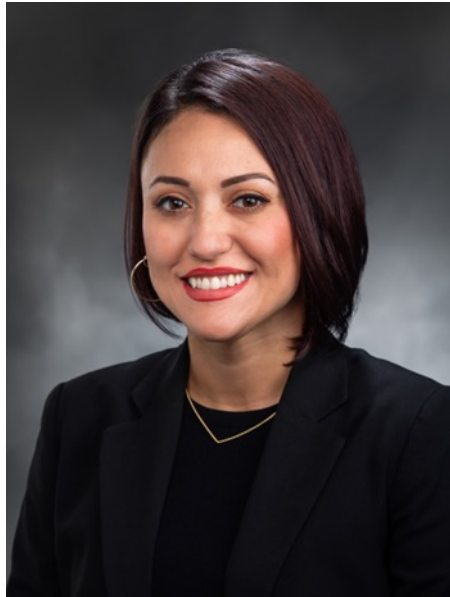
Sen. Yasmin Trudeau (D-27)

Supporters of the Self-Storage & Real-Estate Industry