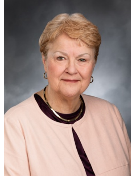
Sen. Judy Warnick (R-13) Republican Caucus Chair (Up For Re-Election - Nov. 2022)