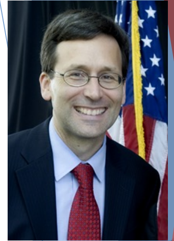
Bob Ferguson, Attorney General

STATUS HB: Dead - Amended in the House. Returned to Senate Rules 3