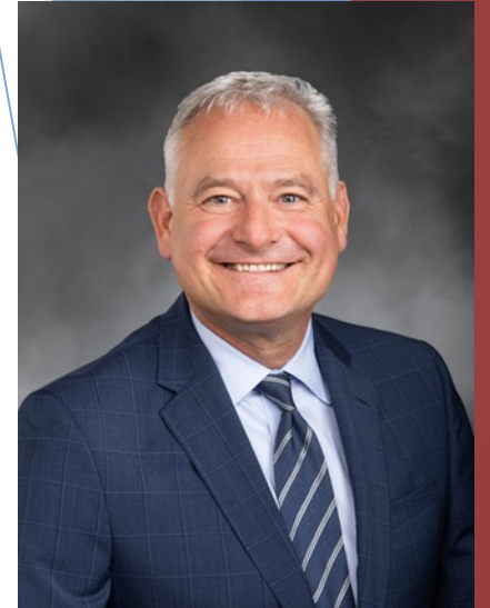
Sen. Reuven Carlyle (D-36)

HB 5957 STATUS: DEAD - Jan 2020 Frist reading, referred to Labor & Commerce